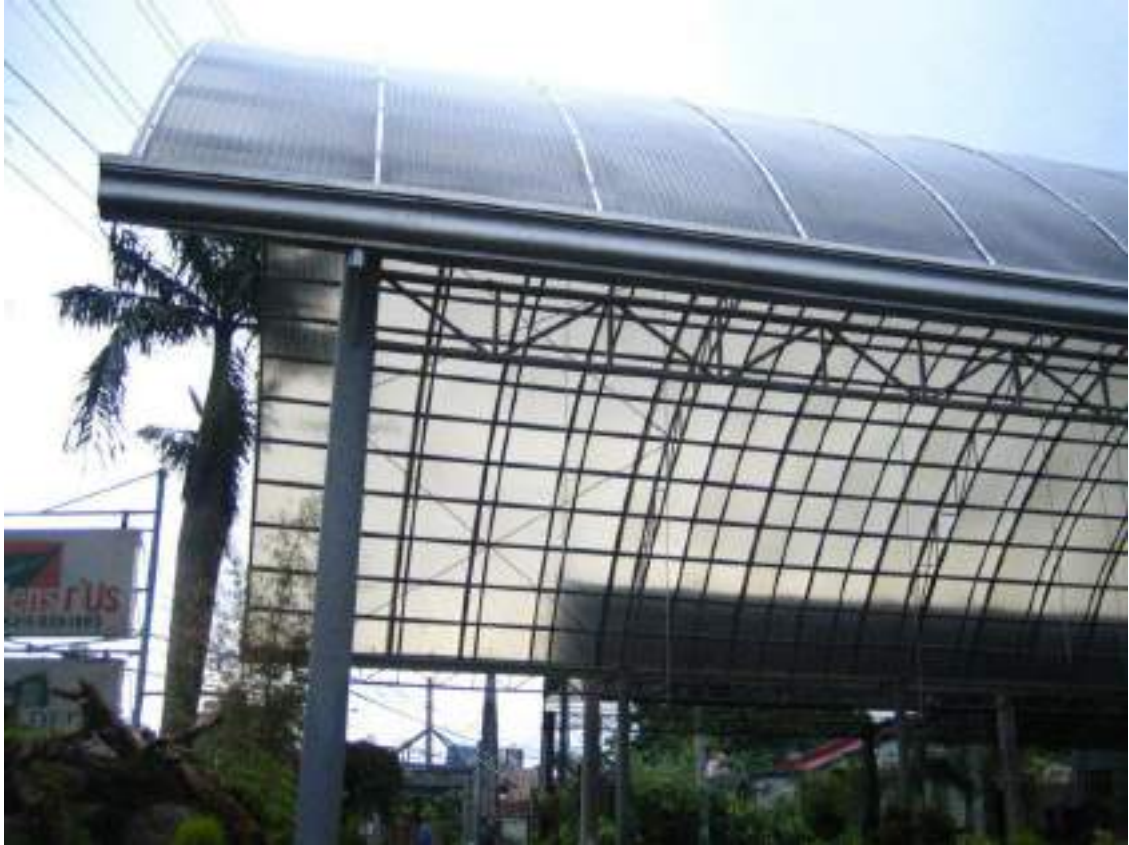
Project in Guizhou China